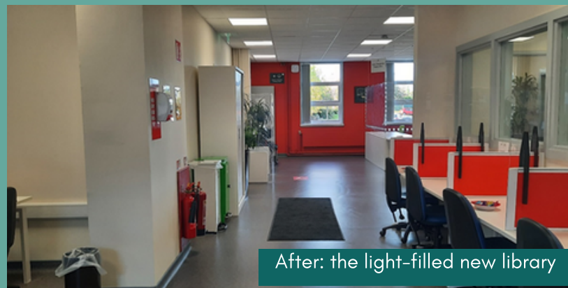
After: the light-filled new library

At the end of 2018, CUH Library was in a sorry state. Despite the best efforts of staff, it was gloomy, not terribly inviting or conducive to study; our seating capacity was just 11, our tables needed replacing and our then-PC area was not fit-for-purpose. Ceiling tiles were damp or missing, exposing electrical wiring, pipes or cabling, and wiring generally had become a hazard.