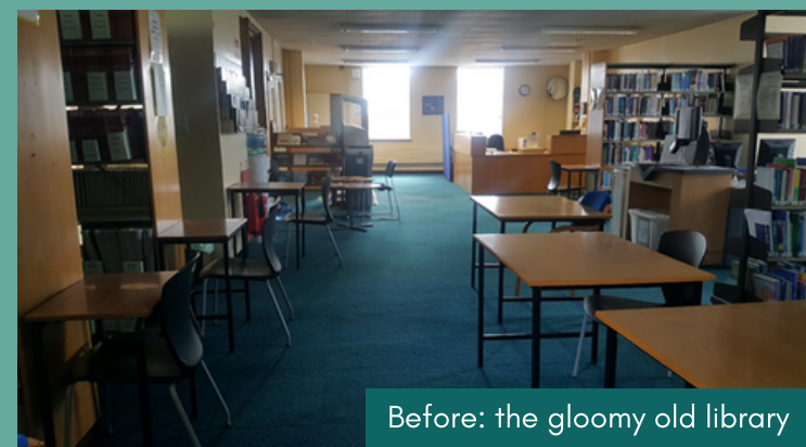
Before: the gloomy old library