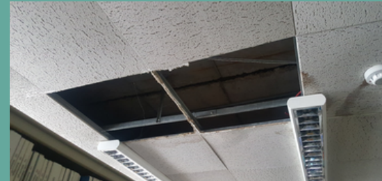
Mind your head...the old library ceiling