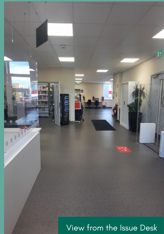
View from the Issue Desk

We are also operating a 'contact and collect' system for registered library users to borrow print material and we continue to answer queries by email, phone or in person at the library. We develop and deliver training sessions on the HSE's electronic resources using medical databases, point of care tools, developing search strategies and using bibliographic software or screening software - contact us at cuh.library@hse.ie or check out our library page.