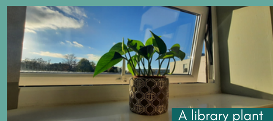
A library plant

While the core design of the new library was completed by January 2020, it remained closed while we re-organised stock, awaited various deliveries and arranged for ongoing IT, system or repair works. We now had new flooring, wiring, ceilings, lighting, a new Enquiry Desk and Staff Office, a new Training Room, a dedicated Book Room, 18 new study spaces, 19 new HSE-networked pcs, new photocopiers & printers, a new seating area and last but not least, some plants.