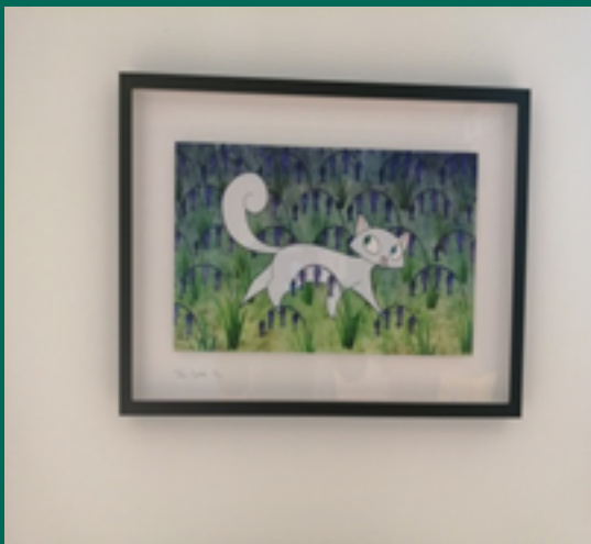
Pangur Bán from The Secret of Kells limited edition print series.